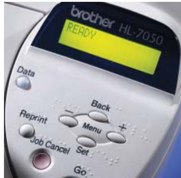
Braille control panel and tri-colour display for ease of identification and use.

Around fifty per cent of all flat screen monitors sold worldwide are TCO-certified – a similar demand for TCO-compliant printers is now expected. Achieving the standard means that Brother has reduced electromagnetic emissions from the printer to a level fifty times lower than the UK's leading workgroup printer. It has also met a variety of other requirements, including energy saving measures, easily recyclable plastics, limits on noise levels and better visual ergonomics.